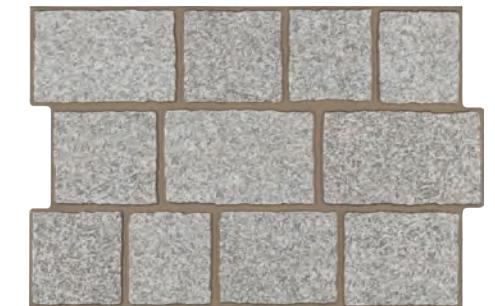
Conques Granito Gris