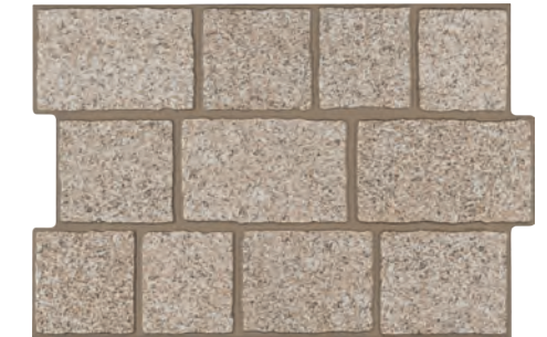
Conques Granito Beige