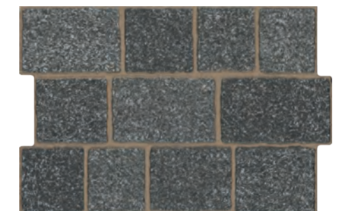
Conques Granito Noir