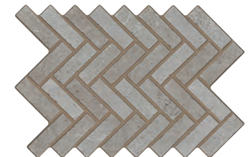
Spica Taxos Grey