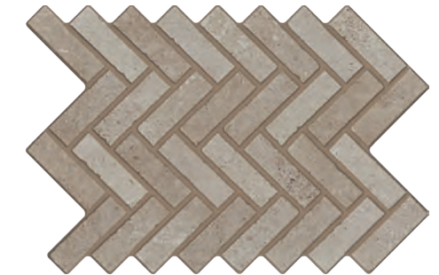
Spica Taxos Taupe